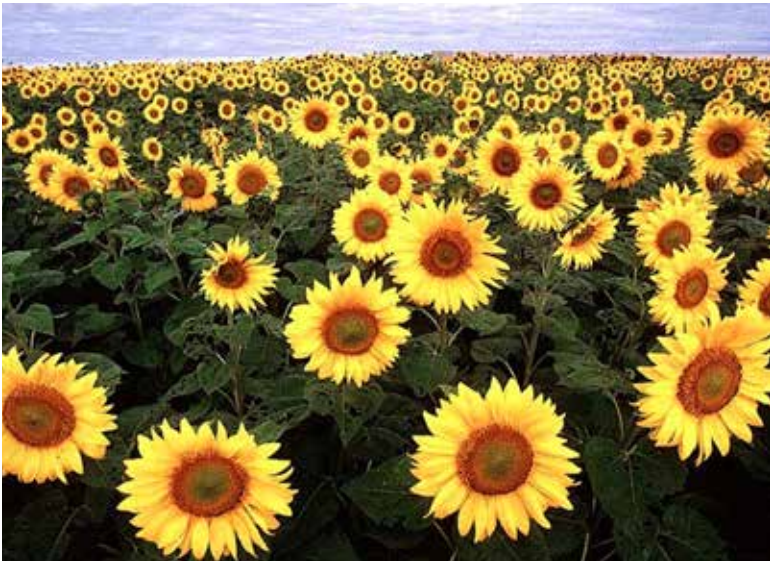
TOP: Free Stock Photos/USDA BOTTOM: USDA